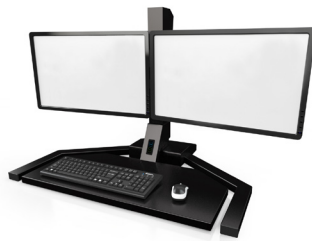
Dual Monitor Configuration