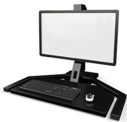
Single Monitor Configuration