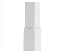
Height Adjustable Base