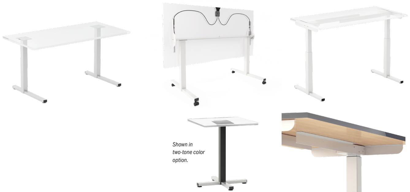
Shown in two-tone color option.